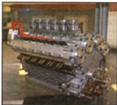
The Ferrari V-12 model engine is amazing in its detail. (Russ Albertson)