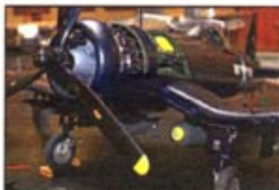
An incredible Fine Art Model of the Corsair. (Russ Albertson)