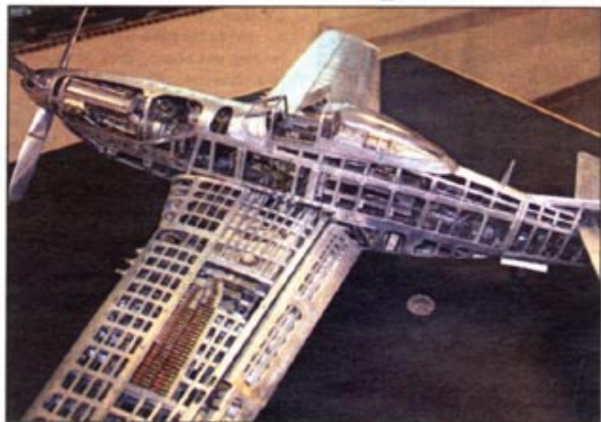
Shown here is the all aluminum model of the P-51. (Note the quarter dollar coin on the right for scale.) (Russ Albertson)